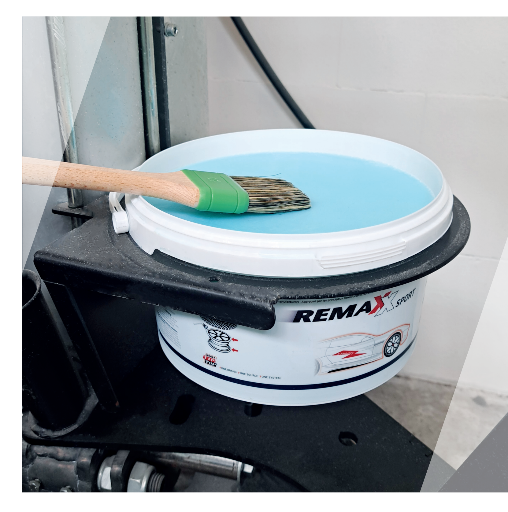
REMAXX MOUNTING AGENTS AND ACCESSORIES

High performance mounting assistance for optimal and careful assembly flows