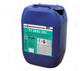
593 1252 TT SEAL XXL 20 | PE-barrel