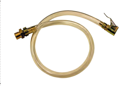
593 1284 Valve adapter