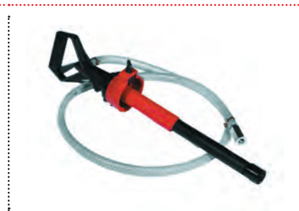
593 1277 TT SEAL XXL hand pump